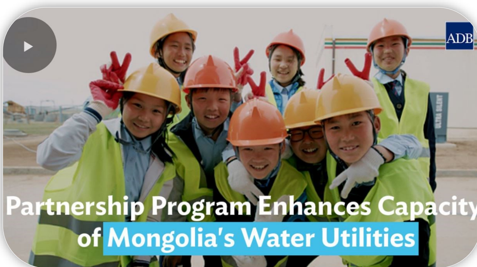
Partnership Program Enhances Capacity of Mongolia's Water Utilities

The Water Operators Partnership Program in Mongolia complemented ADB-supported projects on wastewater and sludge management and paired public utilities in Uvurkhangaï and Bulgan provinces of Mongolia with King County Wastewater Treatment Division from Seattle, USA. The program has improved capacity of local operators through sharing of expertise and best practices in wastewater treatment plant operation and maintenance, systems monitoring, asset management, and safe sludge handling and reuse. An innovative feature of the program was community education and engagement activities that aimed at enhancing citizens participation in environment protection by raising understanding about safe sanitation and wastewater treatment processes. These activities also established a good